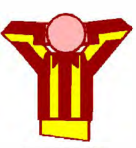
LOSS OF DOWN