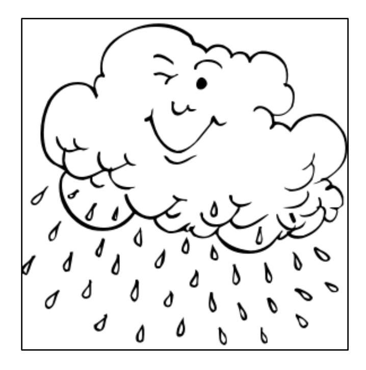
For weather cancelations: